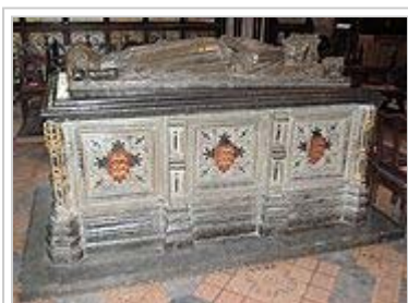
King John's tomb

King John's reign has been traditionally characterised as one of the most disastrous in English history: it began with defeats—he lost Normandy to Philip Augustus of France in his first five years on the throne—and ended with England torn by civil war and himself on the verge of being forced out of power. In 1213, he made England a papal fief to resolve a conflict with the Roman Catholic Church, and his rebellious barons forced him to sign Magna Carta in 1215, the act for which he is best remembered.