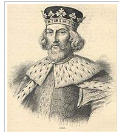
King John as shown in Cassell's History of England (1902)