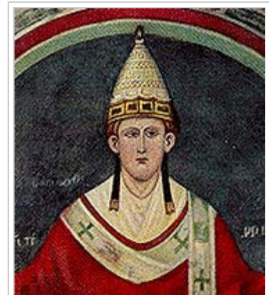
Pope Innocent III and King John had a disagreement about who would become Archbishop of Canterbury which lasted from 1205 until 1213.

Coming to terms with Llywelyn I, Prince of Gwynedd, following the Welsh Uprising of 1211 and