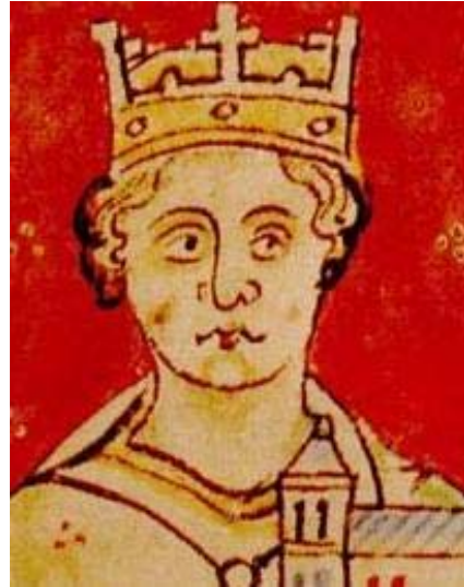
John from the Historia Anglorum'